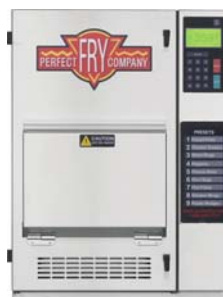
Stainless Steel Model