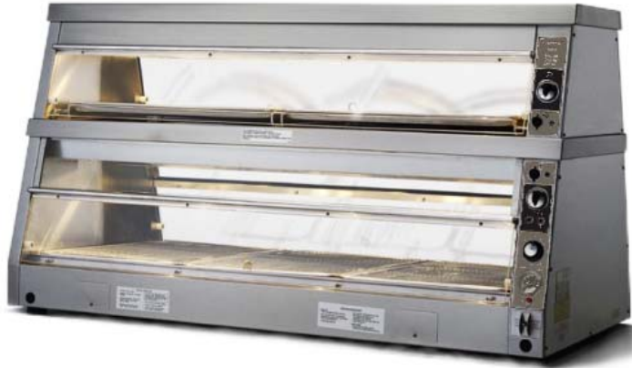
CWH-23 two-tier display counter warmer with flip-up pass-through doors and lower-tier moist heat operation.

MODEL CWH-23 two tier, 5-pan CWH-35 two tier, 8-pan