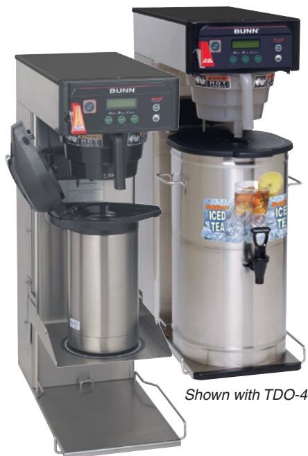
Shown with TDO-4